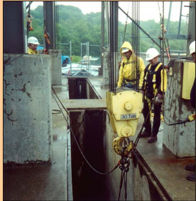
Lowering ASFM frame into intake at Unit 1 Hydro Kennebec, Maine

The R&D Q-Turbulence project consisted of two parts: 1) Direct measurements of turbulence at a series of locations in the intake, and 2) Calibration of AQFlow's CFD model of the intake.