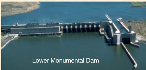
Lower Monumental Dam

The US Army Corps has quickly put into service its recently purchased ASFM Advantage system to provide detailed flow measurements at John Day Dam on the Columbia River and Lower Monumental Dam on the Snake River in Washington State. The testing program, involving ASL providing on-site technical support services, was carried out at the John Day Dam in December 2001 and at Lower Monumental Dam in January (unit 2) and February (unit 6). These turbine efficiency tests are part of a larger Power Plant Efficiency Improvement Program being undertaken in the US Army Corps Portland and Walla Walla Districts.